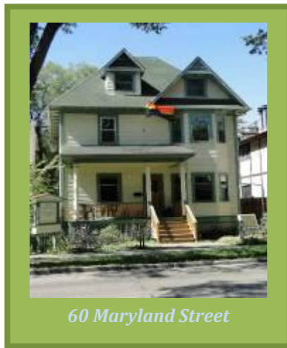
60 Maryland Street

The Property Work Group met seven times in 2011. All members have agreed to continue until spring of 2013. However, we have contacted the Volunteer Recruitment committee requesting more members now for