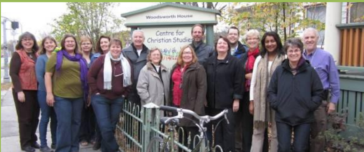
2011-2012 Pastoral Care Year

This past summer there was a GPE undertaken by three of our current IY students to Peru to study Human Trafficking the trip was good, but unfortunately they didn't learn very much on their topic of study.